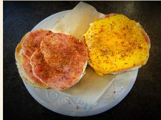
Pizza Bagel - 7.25 Open faced bagel w/ cream cheese, pizza seasoning, Canadian bacon and cheddar cheese tops.