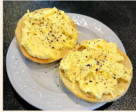
Moon Butter Bagel- $6.50- Hard boiled eggs, real butter, sea salt & cracked pepper.