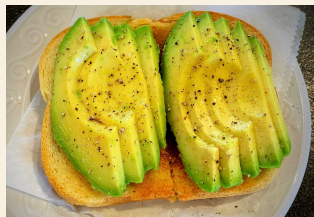
Avocado Toast - 5.95 sour dough/whole grain/GF 7.95