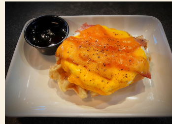
Open Faced Waffle Toasted maple waffle w/ egg, cheese & bacon