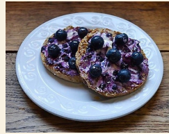
Ezekiel Muffin $6.75 Cinnamon raisin sprouted grain muffin w/ blueberry vanilla goat cheese, blueberries & maple syrup.