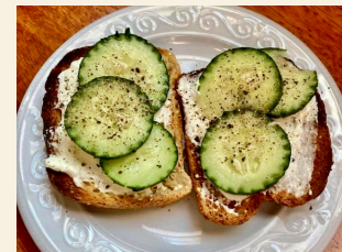
Toast w/ toppings - 5.50 (Cukes on GF bread. -GF & cukes 7.50) (See list of toppings)