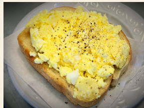
Open Faced Egg Salad-5.50