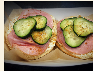
Cool Cucumber Pizza Bagel - 7.25 Open faced bagel w/ cream cheese, pizza seasoning, Canadian bacon and topped with fresh cucumbers.